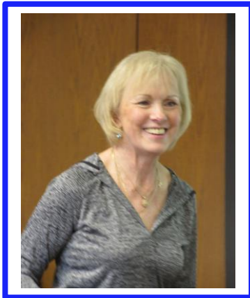
HLAA-TC President's Message February 2018