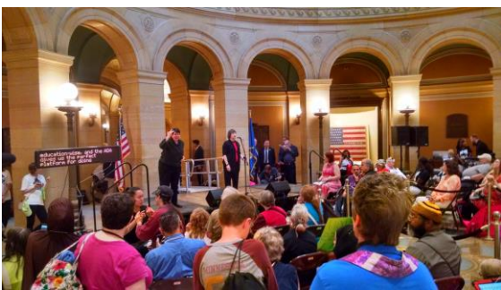
ADA Day at the Capitol