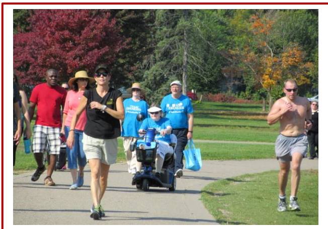
Here they come!