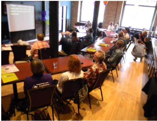
Captioned, of course!