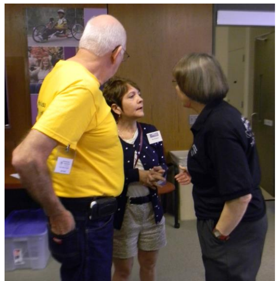
Meeting up with old friends