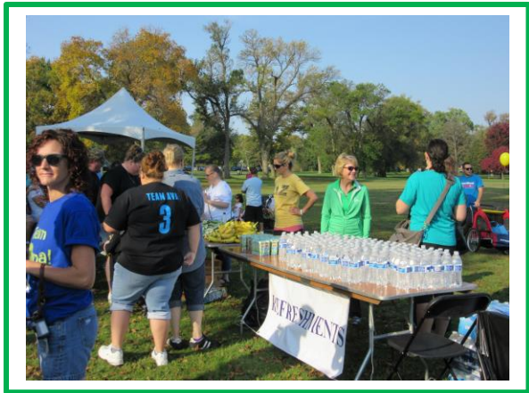
Walkers stock up