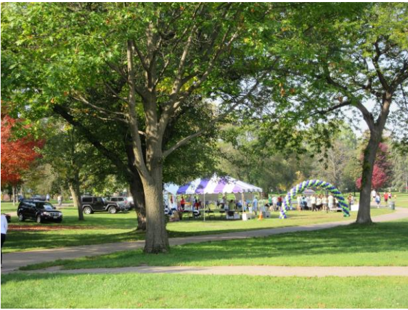
Minneapolis walk site