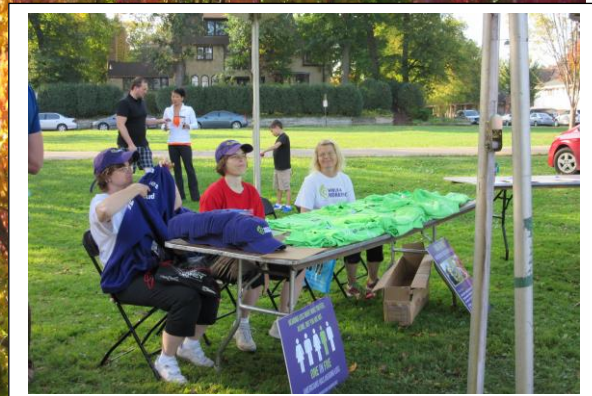
Shirts for walkers!