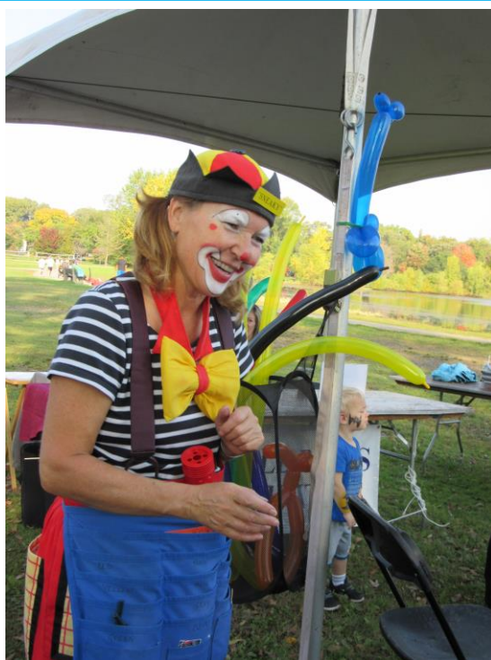
Clowns abound – with balloons!