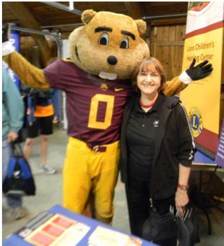
Goldy and Monique