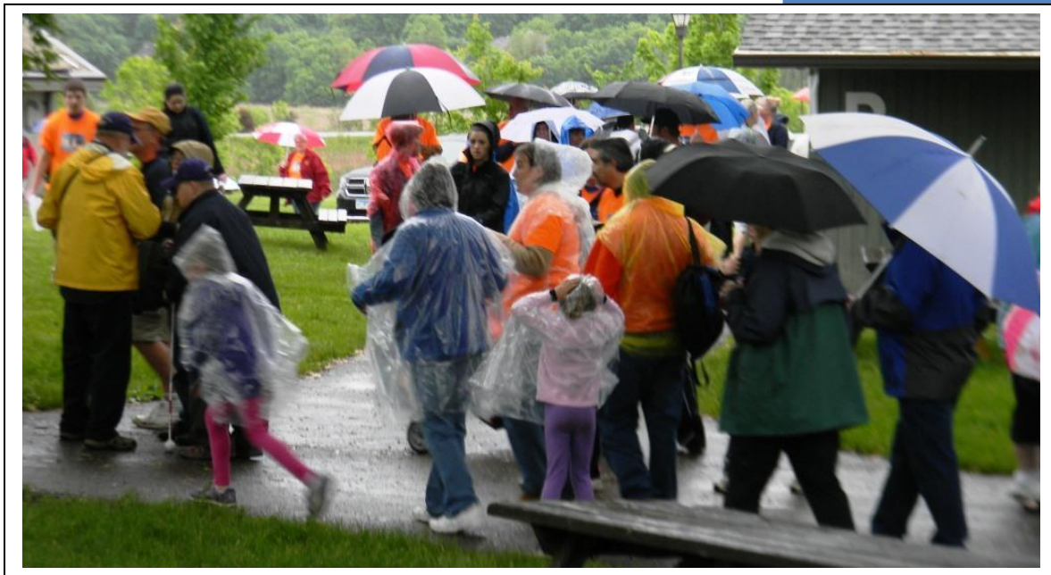
The Walk begins!