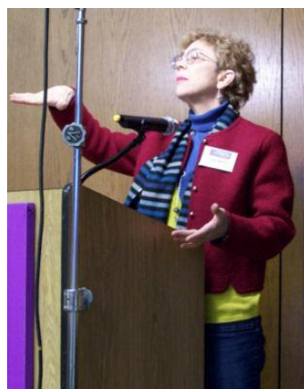
It's ASL time