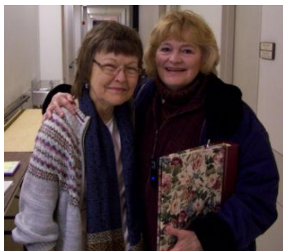
President and VP