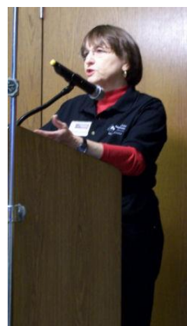
Our MCDHH Rep.